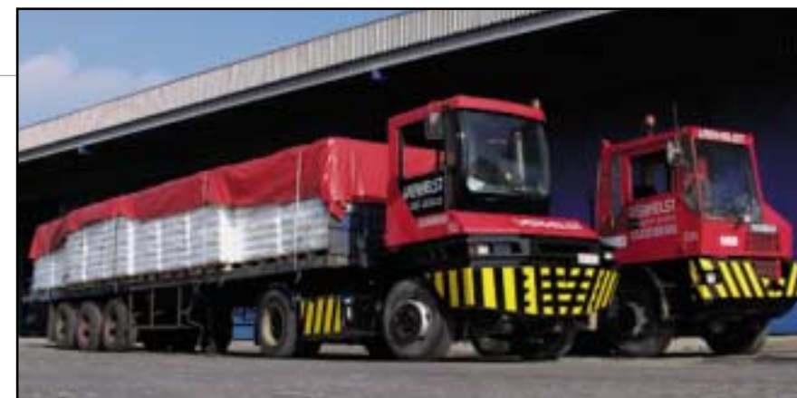
Own fleet of flat trailers fully equipped with straps and sheets.