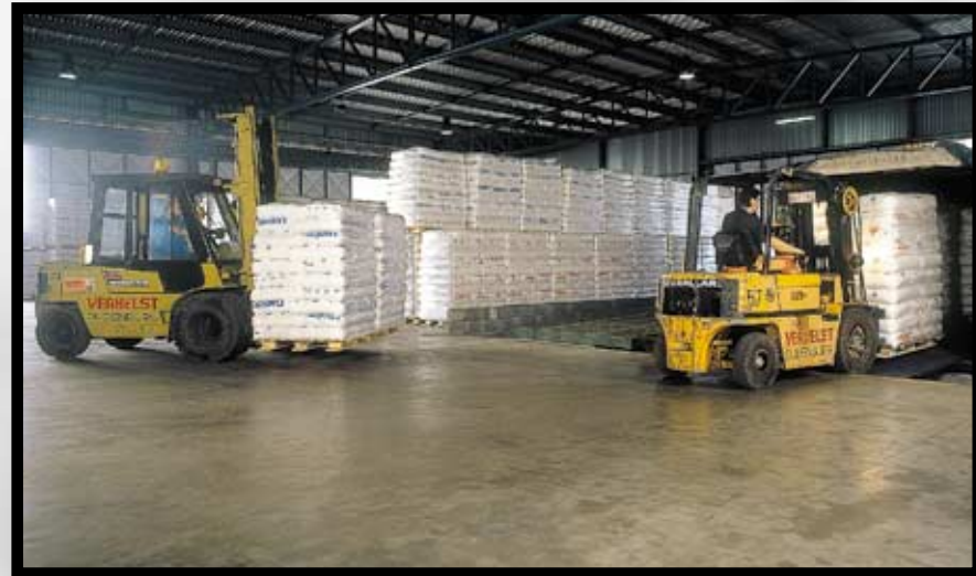
Own sheds for transshipment in the docks of Ostend. Handling facilities for all palletised and packed goods.