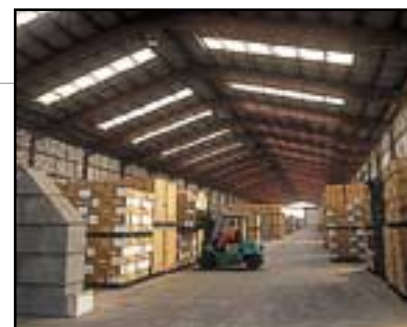
We have all of the necessary handling adapters, like twin-fork, paper roll clamp, etc.