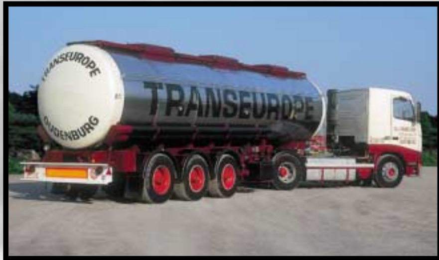
stainless steel liquid tankers for chemical products 35 m 3