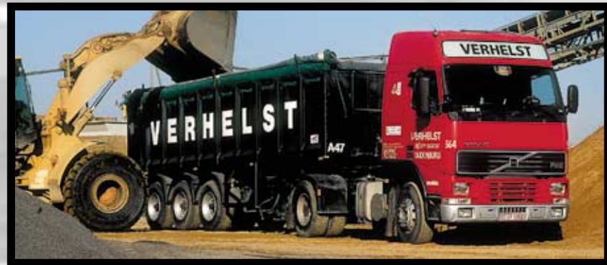
tippers for sand and crushed stone up to 35m 3