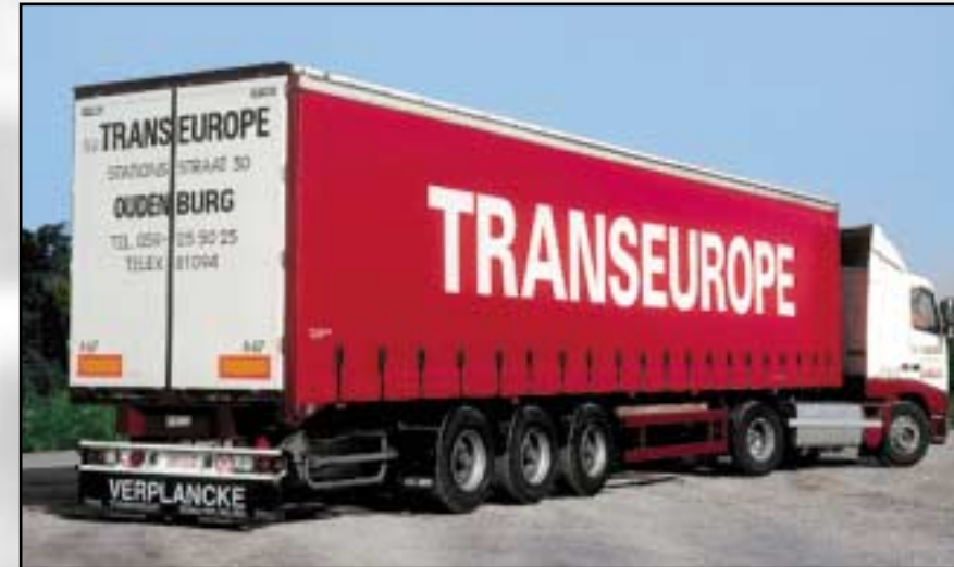
tautliner: loading and unloading facilities, both side and rear

Transeurope focuses primarily on two major activities. On the one hand tanker carriage for various fluids. On the other hand transporting palletised and packed products. It serves the most far-flung outposts of Europe. Fast, punctually, and with the greatest possible care for your goods.