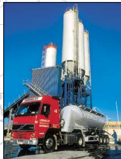
bulk powder hopper trucks up to 35 m 3

Powder tankers for cement etc., and tautliners for palletised or packed goods. Moreover, we have our own well equipped sheds for transhipment in ports, with unloading facilities according to customer needs.