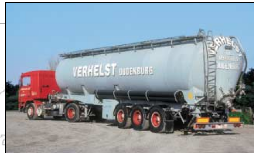
tipper tankers up to 63 m 3